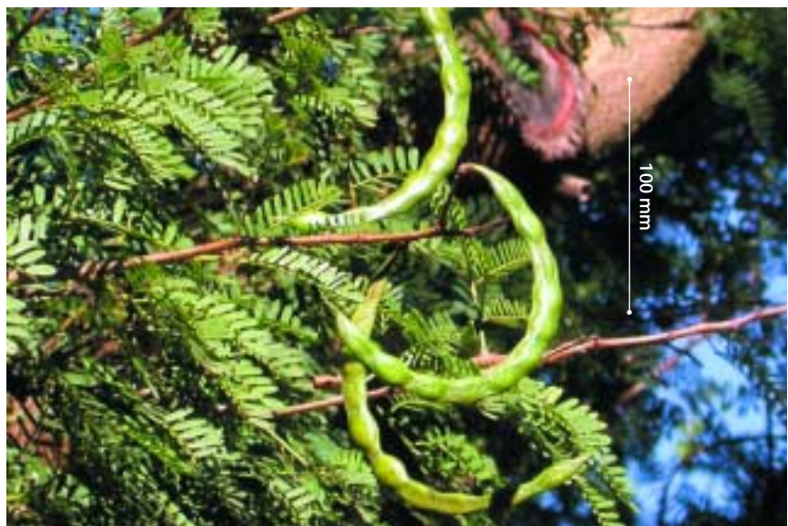
Curved sickle-shaped seed pods are a distinctive feature of Karroo thorn.

If left unchecked, Karroo thorn would damage Australia's environment and economy