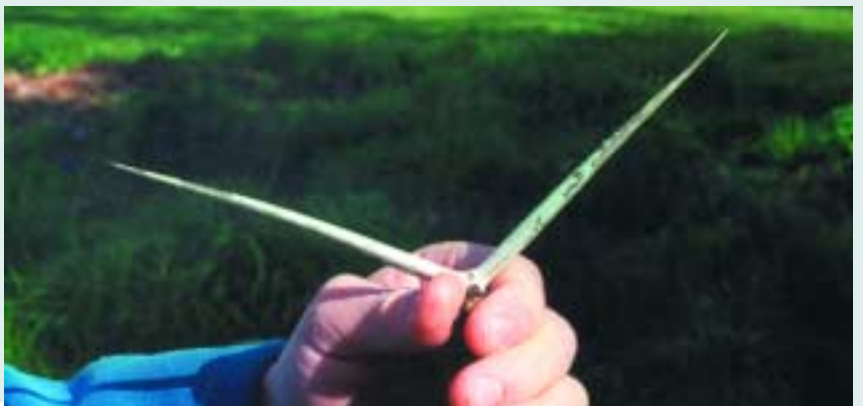
Large thorns up to 250 mm protect the leaves from browsing animals.

Other parks, zoos and councils have also sought to remove their specimens. Karroo thorn plants have recently been removed from Kings Park in Perth, Western Australia, Stockton in New South Wales, and the Werribee Open Range Zoo and Melbourne Zoo in Victoria. Other sites are preparing similar removals.