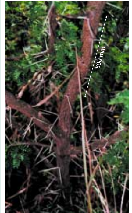
The spines are longer, stronger and more numerous at the base of the tree.

Karoo thorn seedlings grow faster during their first three months than most other African acacia species and can reach a height of 2 m in their first year under favourable conditions. Trees develop a deep root system and usually live for 20–30 years. Plants may flower several times during the summer. The flowers are followed by development of seed pods, which split open on the tree to release small, shiny, brown seeds. The seeds often stay attached to the pods and hang by a thread-like membrane. Germination, which can take place at temperatures from 10 to 40°C, occurs mainly throughout summer but is possible year round under suitable conditions. Optimum temperatures for growth are between 25 and 30°C.