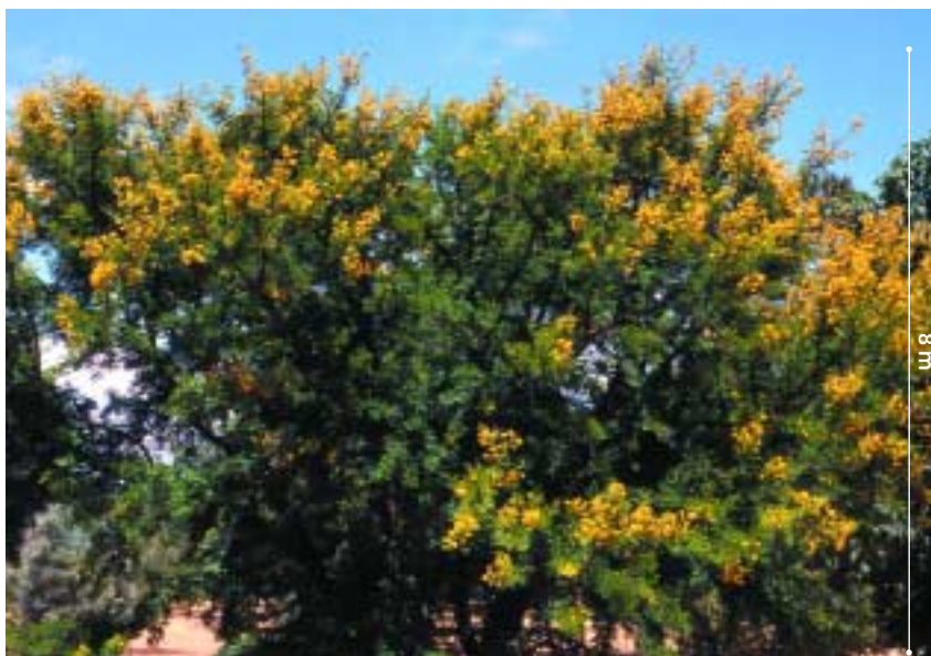
The yellow fluffy ball-shaped flowers are prominent during summer.

In the early days of colonisation in southern Africa, Karroo thorn was used for fuel, fodder and shade, and for the construction of wheels, poles and rural implements. The thorny branches were also used for protection against wild animals.