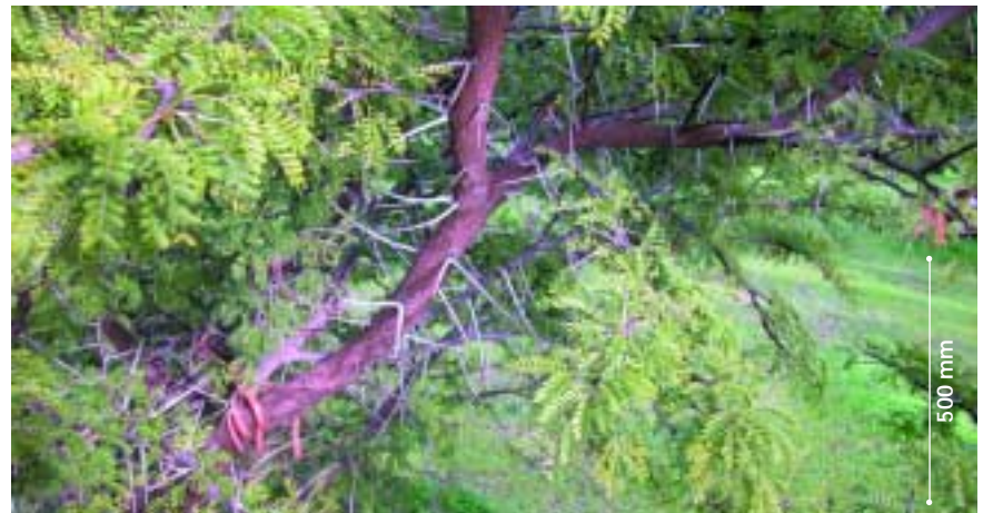
Karroo thorn is considered a weed throughout much of South Africa because it invades grasslands and rangelands.

( Acacia catechu ), another Alert List species which is currently being eradicated from small infestations in Darwin, Northern Territory. Similar to Karroo thorn, a major weed of Northern Territory wetlands, the Weed of National Significance mimosa ( Mimosa pigra ) was also originally planted in a botanic garden. Efforts to control the spread and impact of mimosa by chemical, mechanical and biological means have cost millions of dollars.