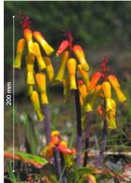
L. aloides has flowers in a range of colours including orange, red, yellow and greenish blue.

The various species of Lachenalia are similar looking, although there is some variation in plant size and flower colour. L. aloides grows 50–310 mm high and has flowers in a range of colours including orange, red, yellow and greenish blue. L. bulbifera grows 80–300 mm high and has orange to red flowers, with darker red or brown markings and green tips. L. mutabilis is the largest of the four species, growing 100–450 mm high, with pale blue and white flowers with yellow tips, and only one leaf. Yellow soldier ( L. reflexa ) is the smallest species (30–190 mm high) and has pure yellow flowers.