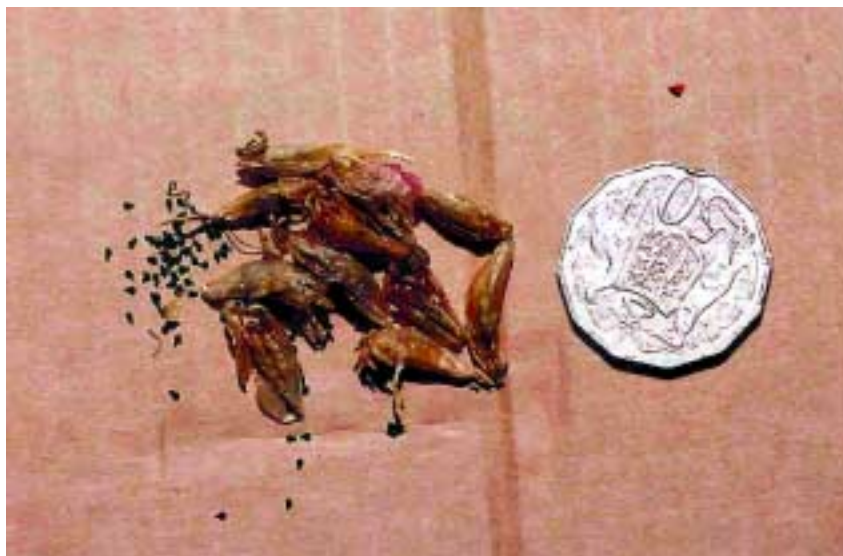
Yellow soldier produces a prolific amount of smooth, shiny, black seed.

As with all weed management, prevention is better and more cost-effective than control. The annual cost of weeds to agriculture in Australia, in terms of decreased productivity and management costs, is conservatively estimated at $4 billion. Environmental impacts are also significant and lead to