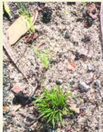
Yellow soldier appears to be tolerant of fire and regenerates soon after bushfires.

Once the initial infestation is controlled, follow-up monitoring and control will be required to ensure that reinfestation does not occur.