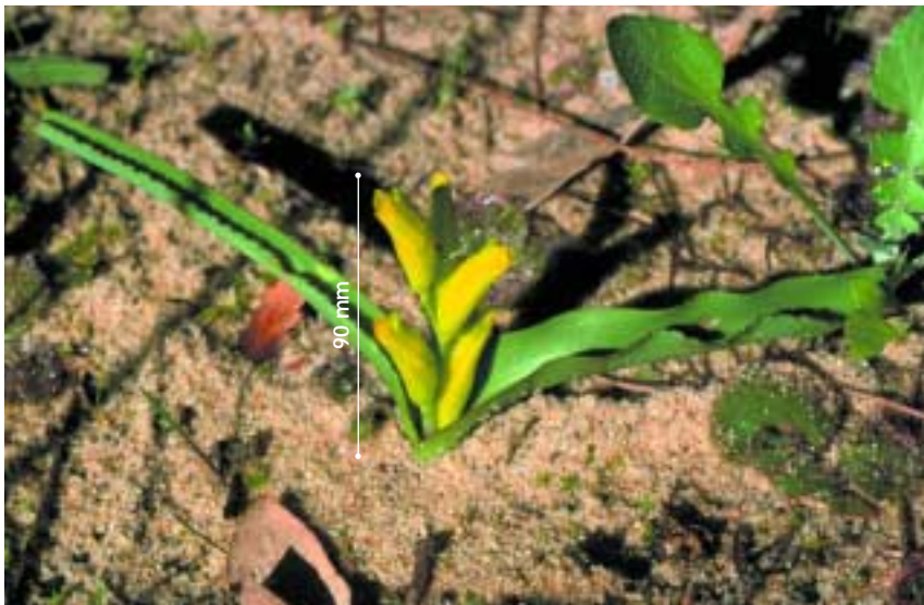
Yellow soldier is the smallest Lachenalia species and has pure yellow flowers.

The above contacts can offer advice on weed control in your state or territory. If using herbicides always read the label and follow instructions carefully. Particular care should be taken when using herbicides near waterways because rainfall running off the land into waterways can carry herbicides with it. Permits from state or territory Environment Protection Authorities may be required if herbicides are to be sprayed on riverbanks.