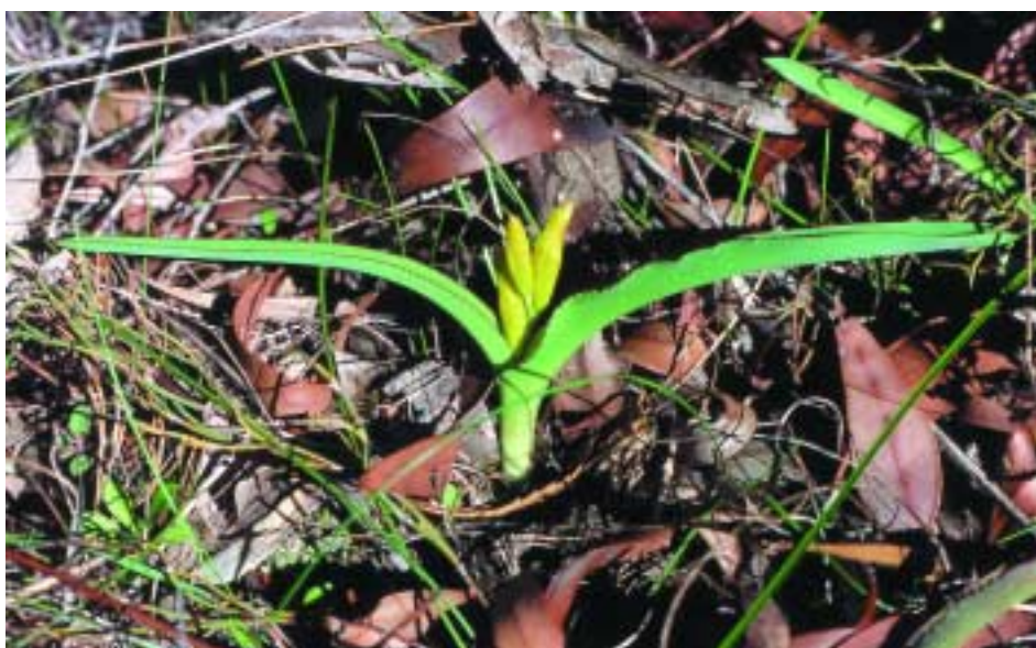
Yellow soldier has two strap-shaped leaves which are slightly V-shaped in cross-section.

Yellow soldier belongs to a group of South African plants, many of which are grown as garden ornamentals. Three other species of Lachenalia are weeds of Western Australia (see Box, p.3).