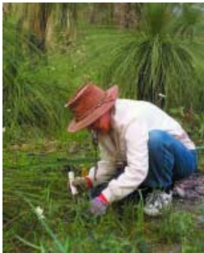
Hand removal of yellow soldier is very labour intensive – up to 6 hours for 4 m 2 – and triggers germination of other annual weeds.

Any control of yellow soldier should be undertaken cooperatively with your state or territory weed management agency or local council.