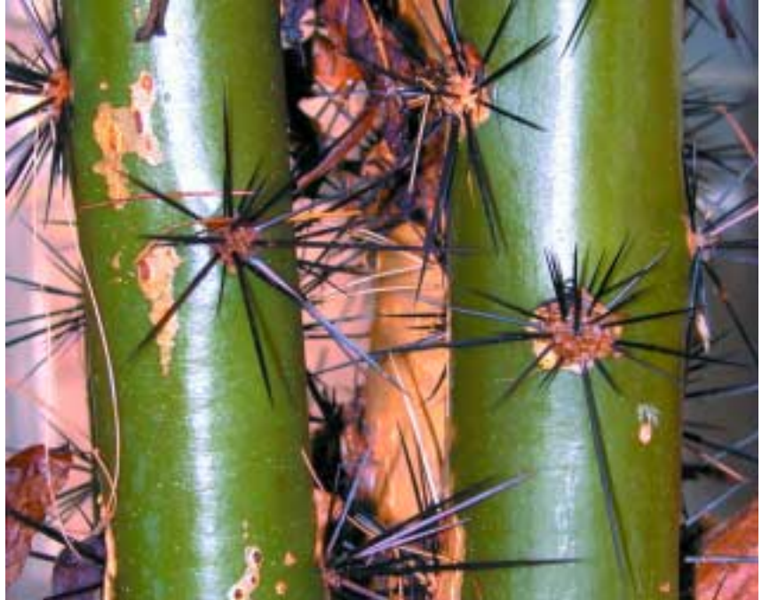
Leaf cactus has groups of long slender spines on the trunk and pairs of recurved spines on its branches.

The many uses of leaf cactus as a nutritional and medicinal plant have encouraged the spread of the plant throughout South and Central America, where it is commercially planted as well as used in the garden. The fruits can be made into deserts, preserves and jams, and the leaves are high in nutritional value. Leaves can be cooked as a green vegetable or put in salads and soups. They are also used in Brazil to treat inflammations and tumours. Leaf cactus is commonly grafted with other Pereskia species to produce ornamental varieties for home gardens.