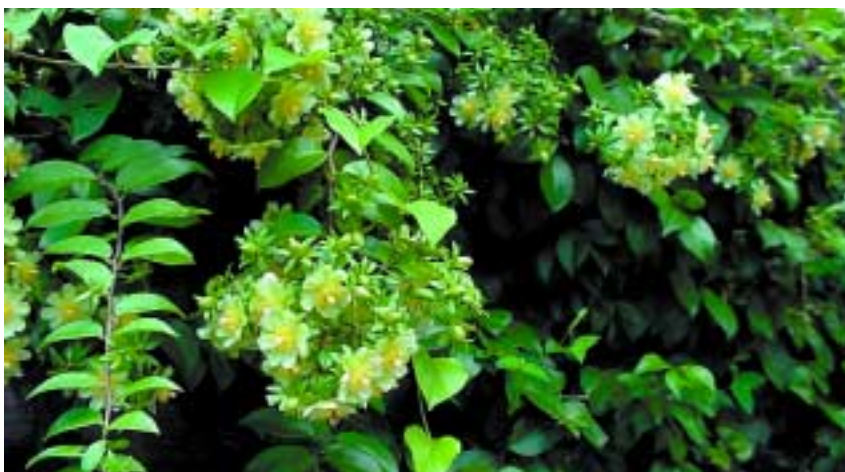
Leaf cactus can form dense infestations amongst riparian vegetation along watercourses.