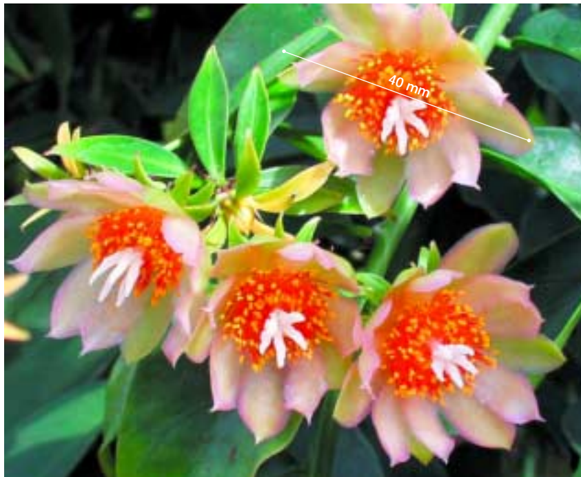
The scented flowers of leaf cactus can be white or pale yellow, sometimes ageing to pink, and have numerous, long, yellow-tipped orange stamens and a prominent white style in the middle of the flower.

Forest managers in KwaZulu-Natal control leaf cactus with a management plan and regular site inspections 4–6 months apart. This clearly shows that unless eradication is carried out while infestations are minor, managing leaf cactus will require ongoing commitment.