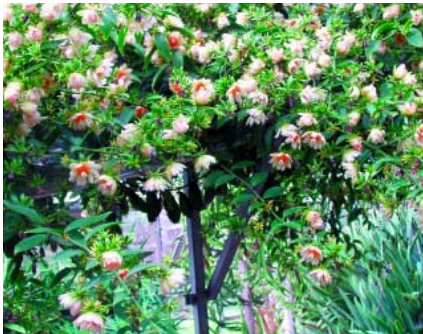
Naturalised populations of leaf cactus are likely to have 'escaped' from gardens where they have been planted as ornamentals.

As with all weed management, prevention is better and more cost-effective than control. The annual cost of weeds to agriculture in Australia, in terms of decreased productivity and management costs, is conservatively estimated at $4 billion. Environmental impacts are also significant and lead to a loss of biodiversity. To limit escalation of these impacts, it is vital to prevent the further introduction and establishment of new weed species, such as leaf cactus. Small infestations may be eradicated if they are detected early, but an ongoing commitment to its removal is needed to ensure new infestations do not establish.