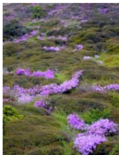
Holly leaved senecio is particularly invasive in open damp areas, and has the ability to dominate understorey vegetation in these conditions.

Holly leaved senecio can be confused with wild cineraria ( Senecio elegans ) at a distance, but up close the two plants are quite different. Wild cineraria is also from South Africa, but is a softer looking annual plant with leaves and stems that are more succulent and hairy than those of holly leaved senecio.