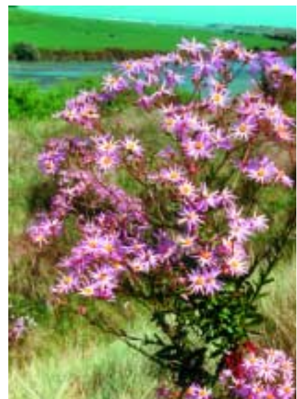
Holly leaved senecio grows frequently near waterways and on hillsides, coastal dunes and disturbed areas.

Holly leaved senecio may potentially be eradicated before it becomes a problem in other locations in Western Australia. Any new outbreaks should be reported immediately to your state or territory weed management agency or local council. Do not try to control holly leaved senecio without their expert assistance. Control effort that is poorly performed or not followed up can actually help spread the weed and worsen the problem.