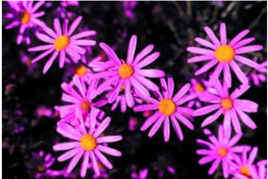
The flowers of holly leaved senecio have yellow centres surrounded by mauve petals.

Being a garden plant, it is quite likely to be available in nurseries, and seeds can be sourced over the internet. With much of southern Australia's climate being similar to that of South Africa, the potential for holly leaved senecio's spread throughout Western Australia, South Australia, Victoria and Tasmania is significant.