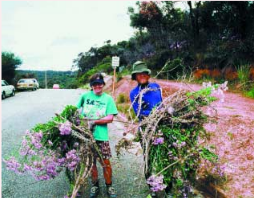
After hand-pulling, holly leaved senecio must be removed from the site, to avoid a recurrence of the infestation in the following year.