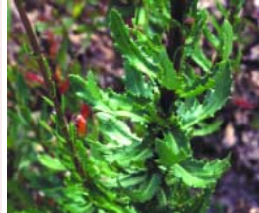
The leaves of holly leaved senecio are highly serrated and can be prickly to touch. They are different to other senecio species.

Holly leaved senecio flowers in late spring. After the flower matures it leaves white fluffy balls of seed, which are apparent in summer and early autumn. The plant germinates in wetter conditions from early autumn through winter, and regrowth of existing plants occurs during the same seasons. Holly leaved senecio generally does not experience a period of dormancy, although in drought conditions it may not grow at all over summer.