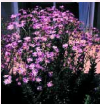
Holly leaved senecio is a short-lived perennial bush.