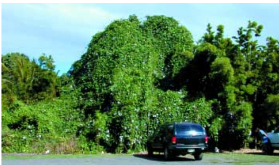
T. laurifolia climbs native vegetation, smothering, shading out and killing the understorey and can pull down mature trees with the weight of the vine.

T. laurifolia is a vigorous, perennial climbing vine. It has oval-shaped leaves which narrow to a pointed tip. The leaves, mostly 70–180 mm long and 25–60 mm wide, grow in opposite pairs along the stem on stalks up to 60 mm long. The trumpet-shaped flower begins as a short