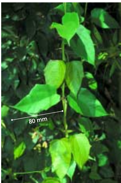
T. laurifolia has oval-shaped leaves which narrow to a pointed tip. They grow in opposite pairs along the stem on stalks up to 60 mm long.

Some 65% of weeds, including T. laurifolia and T. grandiflora , which have recently established in Australia have escaped from plantings in gardens and parks. The detrimental impacts of these weeds far outweigh any potential horticultural benefits. The public should be made more aware of these impacts, and other issues such as how to identify T. laurifolia and T. grandiflora and what to do if they find either species. See the