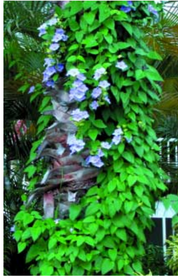
T. laurifolia is a vigorous, perennial, climbing vine that flowers from September through to December, or March in ideal growing conditions.

Do not buy seeds via the internet or from mail order catalogues unless you check with quarantine first and can be sure that they are free of weeds like T. laurifolia . Call 1800 803 006 or see the Australian Quarantine and Inspection Service (AQIS) import conditions database < www.aqis.gov.au/icon >. Also, take care when travelling overseas that you do not choose souvenirs made from or containing seeds, or bring back seeds attached to hiking or camping equipment. Report any breaches of quarantine you see to AQIS.