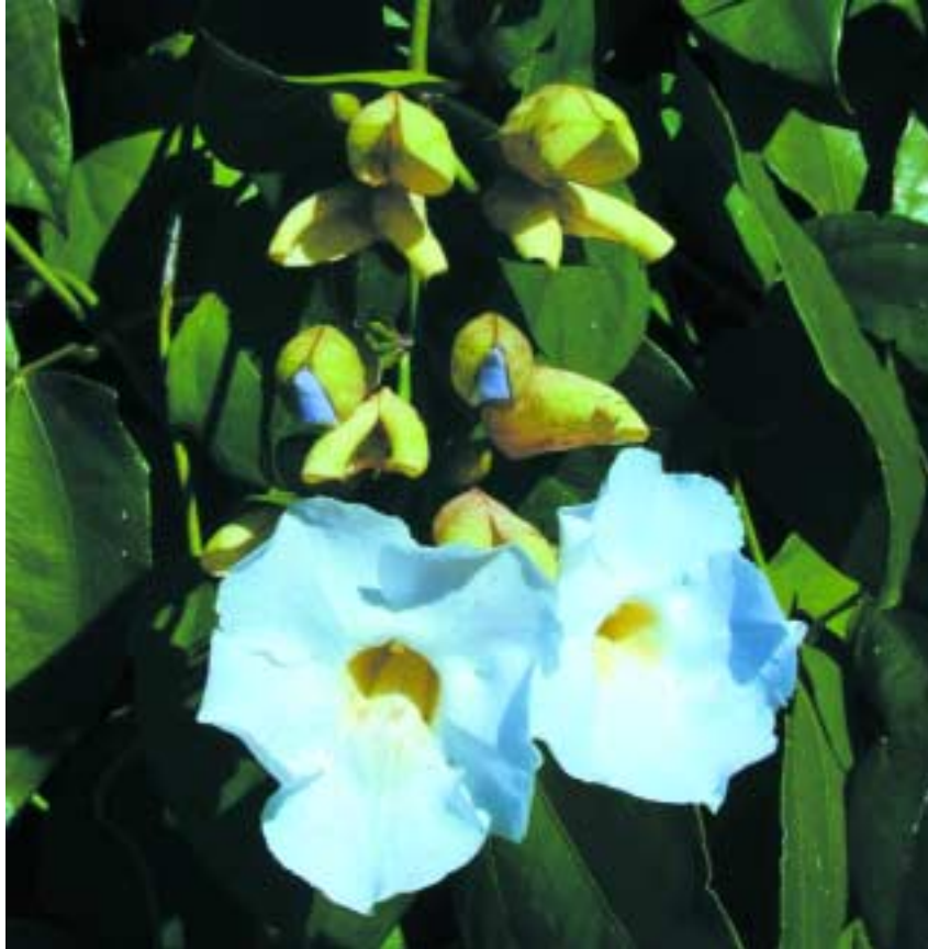
The flowers of T. laurifolia are borne in clusters on long, drooping branches.

T. laurifolia grows rapidly in tropical and subtropical areas but elsewhere young plants die back when temperatures drop below freezing point. It mainly flowers from September to December but may continue flowering until March in ideal conditions. Little is known about seed formation, seed drop and germination in this species. Until recently, it was thought that Thunbergia species in Australia did not produce viable seed, but successful germination of seeds has now been recorded from several species, including T. laurifolia .