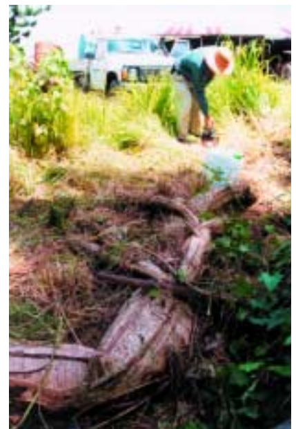
In dense infestations injecting the tubers is not practical as they are numerous and large, often the size of a 4WD vehicle.

Map: Base data used in the compilation of distribution map provided by Australian herbaria via Australia's Virtual Herbarium.