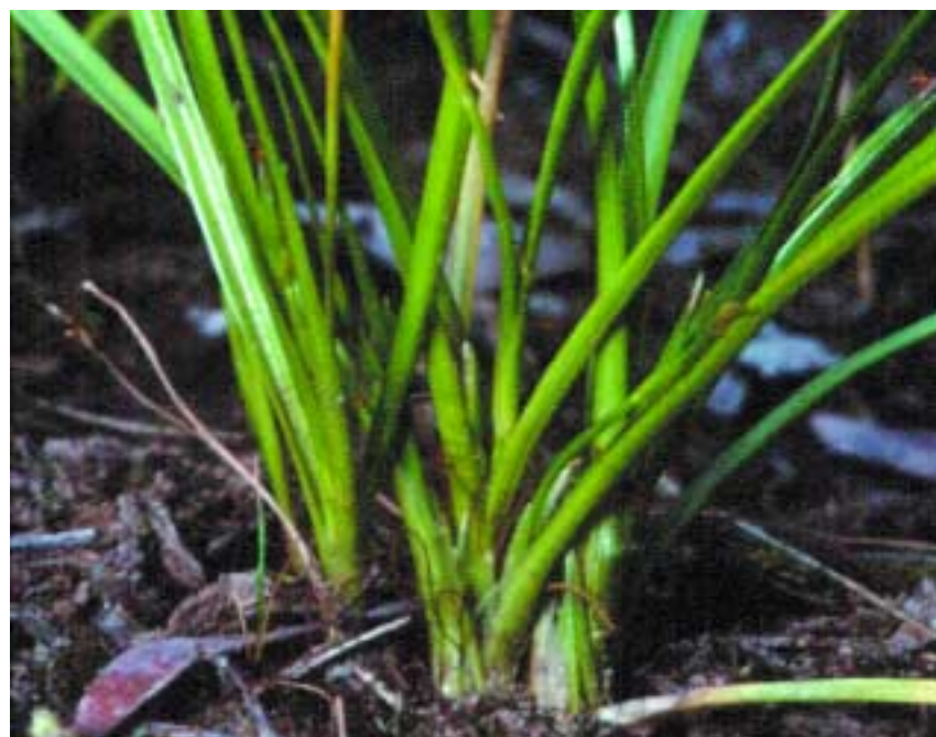
Subterranean Cape sedge is a small, leafy, annual herb with fleshy, smooth, light green leaves that are V-shaped in cross-section.

female reproductive parts. The aerial flower spikelets of subterranean Cape sedge are usually shorter than or equal to the length of the leaves. The 'nut', or fruit, that develops from the aerial spikelets is about 2 mm long and narrowly obovoid (egg-shaped) to narrowly elliptic (egg-shaped but pointed at both ends), with a densely pitted surface. These aerial fruits are triangular in cross-section and are wrapped in three hairy scales that each have a long central bristle and smaller side bristles at the top. In contrast, the basal nut is broadly obovoid and larger than the aerial nut, and does not have scales.